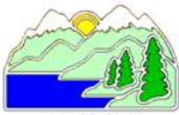
Tahoe City Public Utility District

Skiing for Schools Days at Sugar Bowl from Saturday, December 17 – Friday, December 23: $35 lift tickets are valid any one day from December 17 – 23. Pre-purchase lift tickets the week prior at Porters Sports in Tahoe City or Truckee. A limited quantity of tickets are available on a first come, first serve basis. The proceeds from your lift ticket purchase go directly to the Excellence in Education Foundation, which provides enhanced educational opportunities for our local students. www.ExinEd.org for more information.